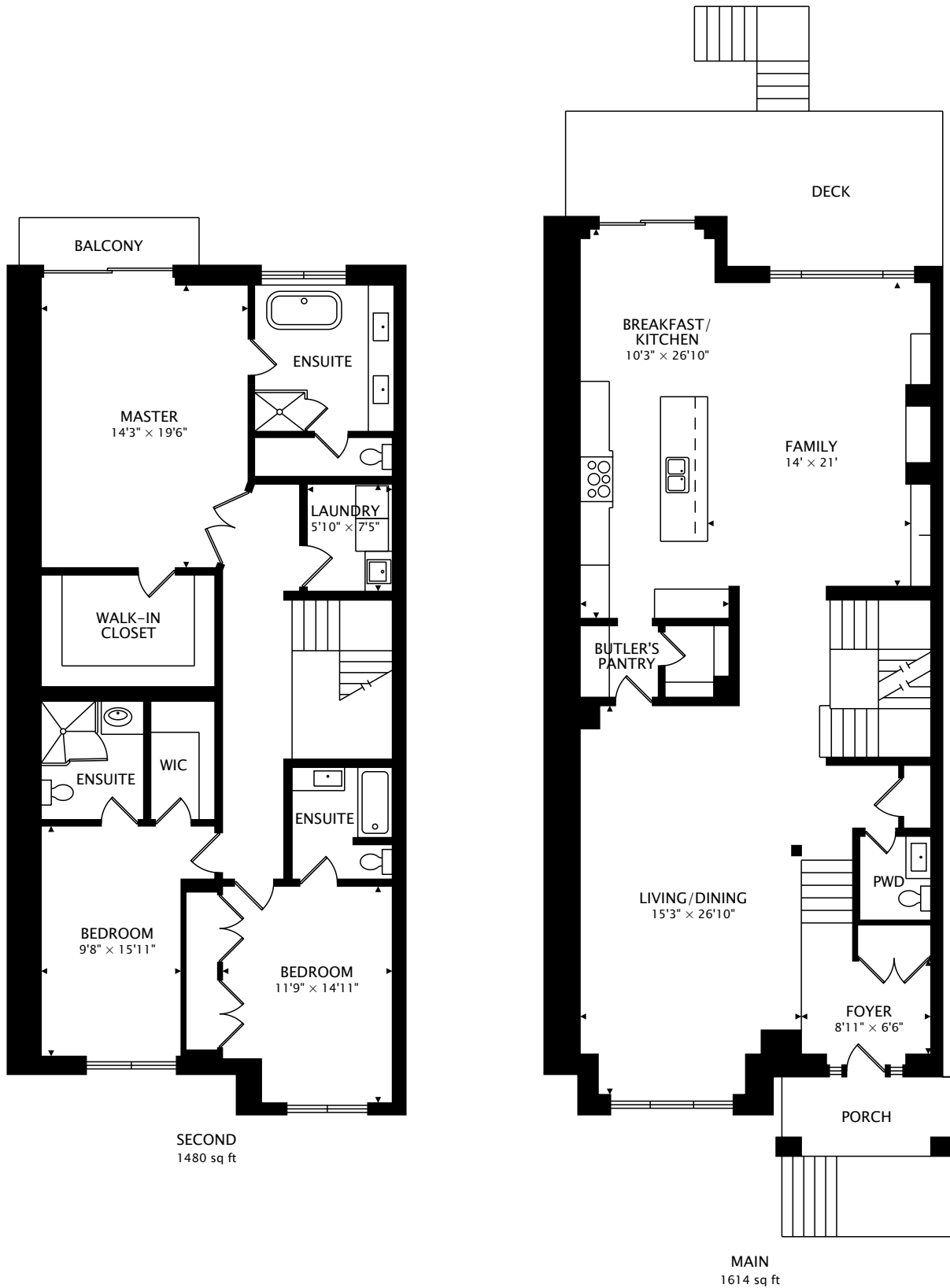
SECOND 1480 sq ft